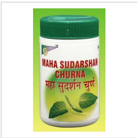
Maha Sudarshan Churna